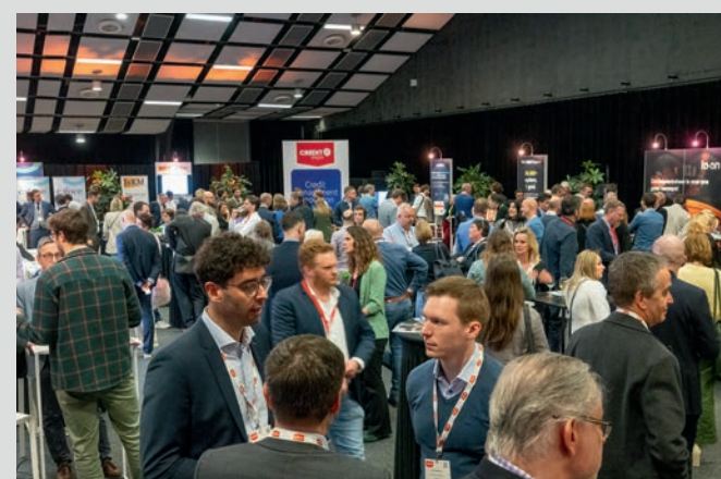
2024 – De Montil Affligem (25 April)