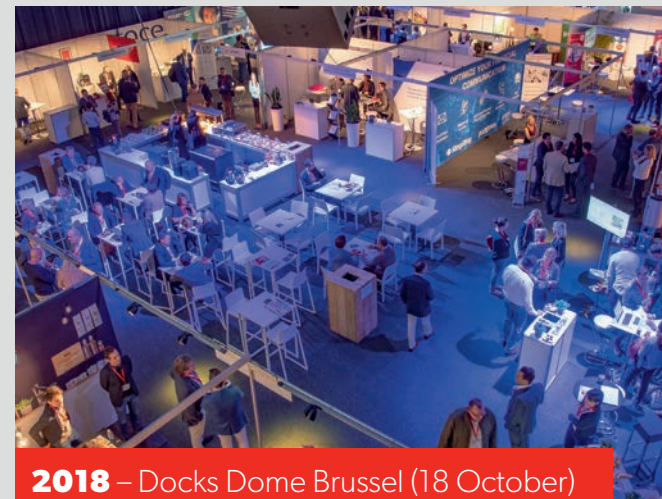
2018 – Docks Dome Brussel (18 October)