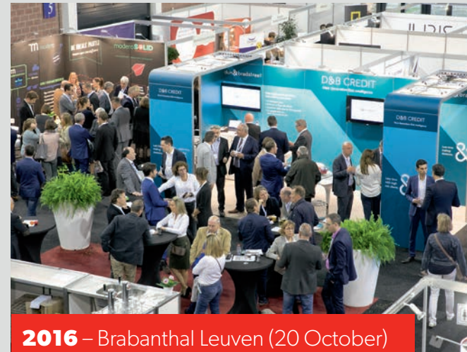
2016 – Brabant Leuven (20 October)