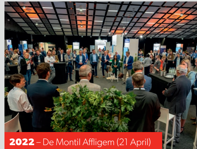
2022 – De Montil Affligem (21 April)