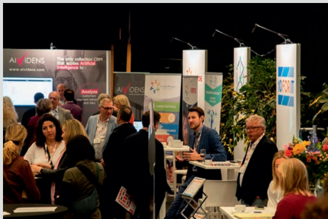
2023 – De Montil Affligem (20 April)