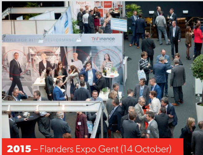
2015 – Flanders Expo Gent (14 October)

2015 - 2016 - 2017 - 2018 - 2019 - 2022 - 2023 - 2024 - 2025