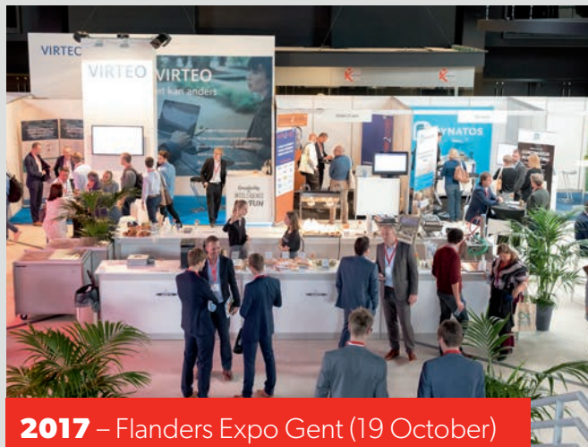
2017 – Flanders Expo Gent (19 October)